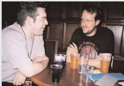
The Vicar and the Rev exchange words and beer